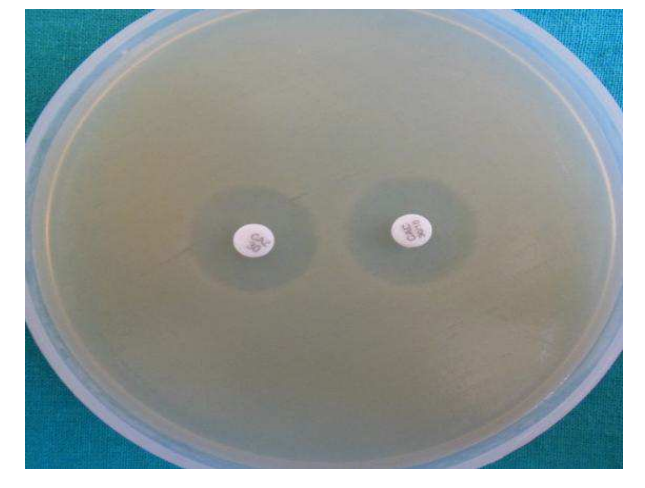
Fig 2: Phenotypic confirmatory test showing ESBL negative isolate

to Ceftazidime disc alone [9]. Statistical Analysis was done by Chi-square test using SPSS software.