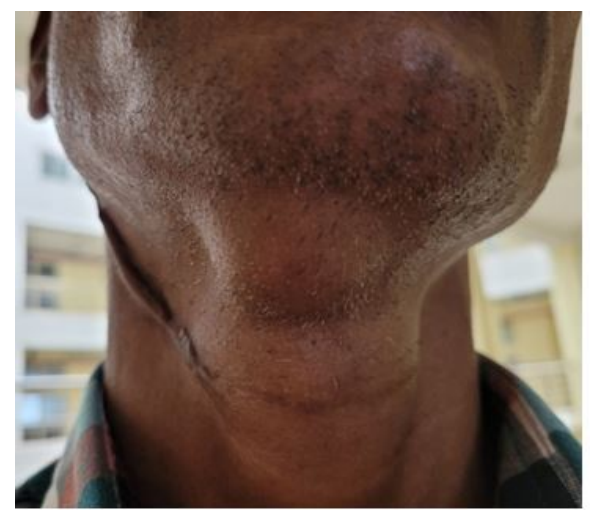
Figure 1: Submental swelling of 2 x 2 cm.

A 40-year-old male presented with chief complaint of swelling in the submental region of the neck for 10-15 days. It was gradual in onset. The swelling progressively increased in size. He also had a history of right-sided submandibular lymph node swelling five months back. He gave a history of weight loss in the last two to three months. On USG, it was reported as abscess formation. During the local examination, there was a palpable swelling of size 2 cm \times 2 cm present over the submental region. It was firm, non-tender, and slightly mobile. Swelling does not move with protrusion of the tongue. There was no local rise in temperature (Figure 1).