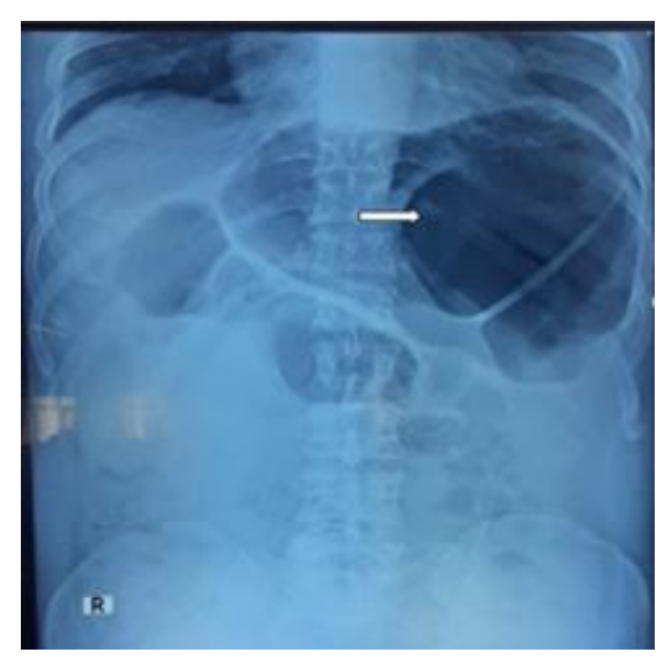
Figure 1: Erect X-Ray abdomen showing distended large bowel loop in the left upper quadrant of the abdomen (arrow).

A fifty-one-year-old male presented with complaints of pain abdomen and vomiting for two days, relieved on taking medications and passing stools. History revealed that the patient in addition had on and off episodes of constipation for which he had taken over the counter medications. On admission, an Erect X-ray abdomen revealed marked distention of a loop of the large bowel in the left upper quadrant (Figure 1).