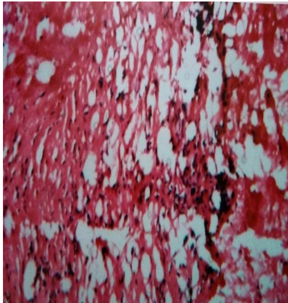
Figure-2: Morphea showing panniculitis (H&E, 10x40)