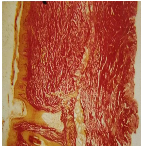
Figure-3: Scleroderma showing compact dermal collagen and replacement of subcutaneous tissue by collagen (VVG, 10x10)

Jaworsky C (1997)[9] pointed out that, mixed connective tissue disease and co-existing conditions associated with the presence of high titres of anti-UI RNP antibodies. In the present study a 29 year old male patient presented with a plaque type of lesion on the lower back and papular lesions on his right thigh which was clinically diagnosed as morphea and lichen planus (an autoimmune disorder) respectively. The histopathologic study confirmed the diagnosis of co-existence of morphea and lichen planus in this case.