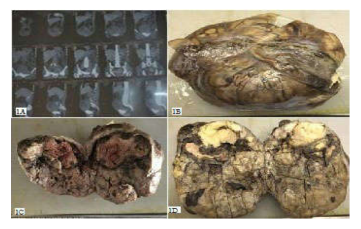
Figure-1: 1a: CT film showing the huge pelvic tumor; 1b: Gross of the tumor mass which is bosselated, encapsulated and with prominent surface vessels; 1c: Cut surface of the tumor showing some haemorrhagic and cystic areas; 1d: Cut surface of the tumor showing some greyish brown to greyish white solid areas On microscopy, the panhysterectomy specimen was unremarkable. Sections examined from various areas of broad ligament mass showed an encapsulated tumour with multiple patterns. Predominant pattern was diffuse solid proliferation along with minor components of microcystic, trabecular and gyriform patterns. No well-formed tubules were seen anywhere. The tumour cells were mainly spindled along with few epithelioid forms, neither of which showed any significant pleomorphism, had a vesicular nucleus with prominent nucleoli and moderate amount of mostly clear cytoplasm. Occasional areas showed nuclear grooving also [Figure 2a-f]. Some of the sections show very prominent vascular proliferation. Mitotic activity was low. No necrosis was seen anywhere.

Specimen 2 was a single, globular, encapsulated paratubal (broad ligament) mass showing prominent surface vessels with attached fallopian tube and ovary measuring 11 x 8 x 5 cm in size. On cutting through the mass, variegated haemorrhagic solid and cystic areas were seen. Twelve sections from various areas of the mass were taken and processed [Figure 1 b, c, d]. Fallopian tube measured 3 cm in length. On cutting tube lumen was obliterated. Same sided ovary measured 1 x 1 cm in size. Cut section was homogeneous grey white. One section each from both the tube and ovary were taken and processed.