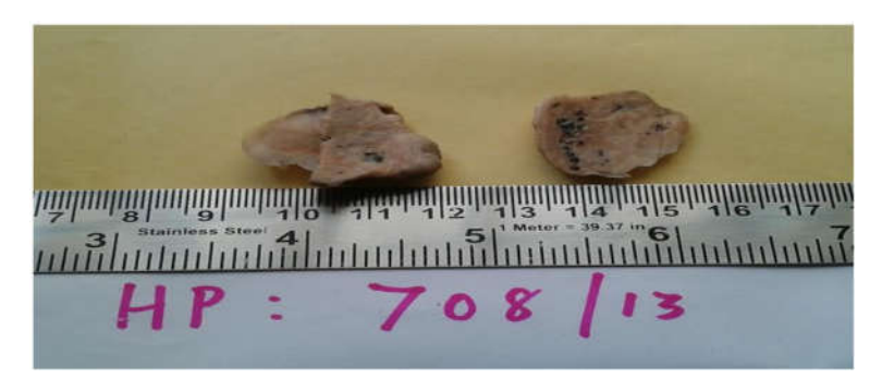
Fig: 1: Specimen received measured 3.5x3x2 cm with grey white cut surface showing few blackish areas.

Twenty year old female presented to OPD department with complains of swelling in right forearm. The swelling was subcutaneous with smooth skin surface and was clinically diagnosed as Lipoma. FNAC was done which showed sheets ofviable and degenerate polymorphs and histiocytes. Biopsy was done and the specimen was received. The specimen received measured 2.5x 1.5x1 cm. External surface of the specimen was grey white and cut surface was also greywhite with few blackish areas. Histopathological examination was done.H&E sections showed Club shaped structures surrounded by neutrophils, histiocytes, lymphocytes, plasma cells, eosinophils, and macrophages and multinucleate giant cells. A diagnosis of Madura mycosis was made.