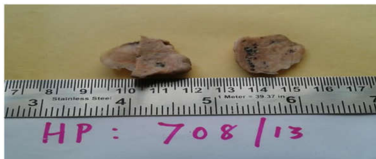
Fig: 1: Specimen received measured 3.5x3x2 cm with grey white cut surface showing few blackish areas.

Twenty year old female presented to OPD department with complains of swelling in right forearm. The swelling was subcutaneous with smooth skin surface and was clinically diagnosed as Lipoma. FNAC was done which showed sheets of viable and degenerate polymorphs and histiocytes. Biopsy was done and the specimen was received. The specimen received measured 2.5x 1.5x1 cm. External surface of the specimen was grey white and cut surface was also greywhite with few blackish areas. Histopathological examination was done.H&E sections showed Club shaped structures surrounded by neutrophils, histiocytes, lymphocytes, plasma cells, eosinophils, and macrophages and multinucleate giant cells. A diagnosis of Madura mycosis was made.