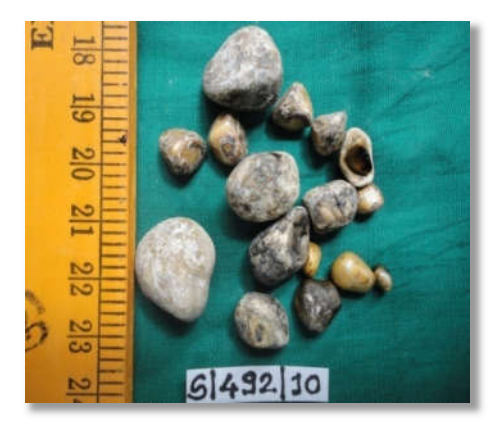
Fig 3 : Multiple mixed stones seen in chronic calculus cholecystitis

Mohan et al (2005) [11] studied of 1100 cases and found that lesions associated with chronic cholecystitis were cholesterolosis in 112 cases (10.1%), Xanthogranulomatous cholecystitis in 26 cases (2.3%), follicular cholecystitis in 26 cases (2.3%), ceroid granulomas in 10 cases (0.9%), eosinophilic cholecystitis in 6 cases (0.5%) and carcinoma in 12 cases (1.09%). Barcia JJ [34] noted 75% incidence of chronic cholecystitis with epithelial metaplasia and 73% with regenerative epithelium. The association of cholecystitis and cholelithiasis was found in 87% cases by Graeme PD et al [35]. Thus, our findings were in accordance with Raza (1990) [14] and Mazlum et al (2010) [12].