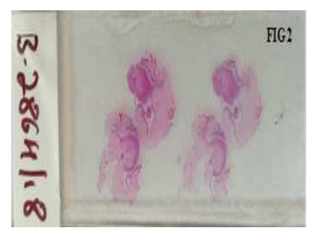
Figure-2: Tissue section showing the umbilical polyp in continuity with the skin lining on either side, H and E stain.

With a clinical diagnosis of the umbilical granuloma, the nodule was excised and sent for the histopathological examination. Gross examination revealed a polypoidal lesion covered one it her side by tiny strips of skin. Nodule measured 1 \times 0.8 cms across. Cut section of nodule was soft and grey white.