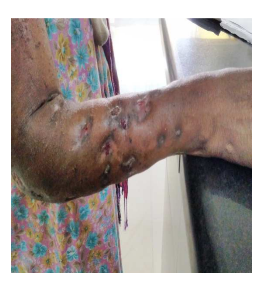
Fig-4a & 4b: Clinical picture showing healed sinuses with scars