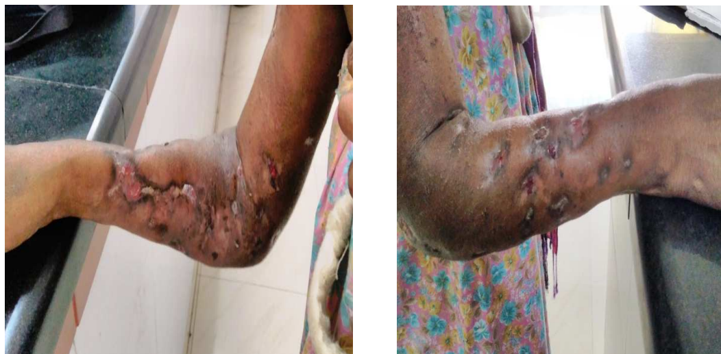
Fig-4a & 4b: Clinical picture showing healed sinuses with scars

Modified ZN stain was negative (with 1% H 2 SO 4 ). Culture of pus from discharging sinuses yielded scanty growth of spidery colonies after 72 hrs but colonies failed to survive on further incubation anaerobically. With this we confirmed it as primary actinomycosis of right upper extremity. Finally, patient was started on injectible Cef zone S 1.5gm and Amikacin 500mg twice daily for 7 days, later advised to take oral Doxycycline and Cefixime for 6 months. The patient responded well to treatment and the sinuses healed with scars [fig 4a & 4b].