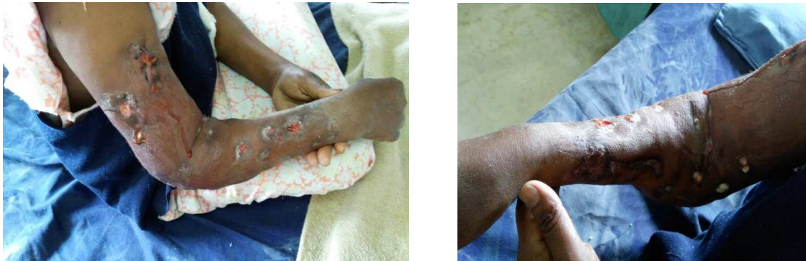
Fig 1a & 1b: Clinical picture showing multiple discharging sinuses involving right arm and forearm.

Laboratory findings revealed raised total leucocyte count of 15,600/cumm, with neutrophils 69%, lymphocytes 25%, eosinophils 3%, monocytes 3%. Hemoglobin was 10.0gms%, PCV 32%, ESR 40 mm/hr, random blood glucose 101mg/dl, blood urea nitrogen 20mg/dl, serum creatinine 1.1mg/dl, serum uric acid 7.7mg/dl. Serum electrolytes were within normal limits. SGOT 55U/L (5-35), SGPT 40U/L (5-35), Alkaline phosphatase 256 U/L (53-128), C - reactive protein 19.0mg/dl (0-0.6mg/dl) [1:2 dilution by turbidometry method].